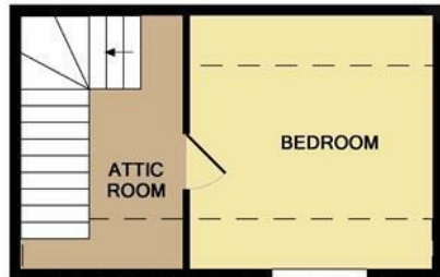
2ND FLOOR APPROX. FLOOR AREA 225 SQ.FT. (20.9 SQ.M.)

TOTAL APPROX. FLOOR AREA 1179 SQ.FT. (109.6 SQ.M.)