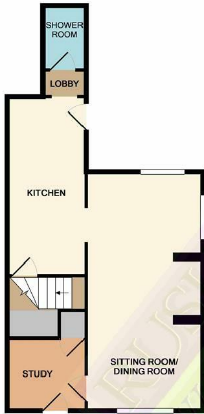
GROUND FLOOR APPROX. FLOOR AREA 524 SQ.FT. (48.7 SQ.M.)